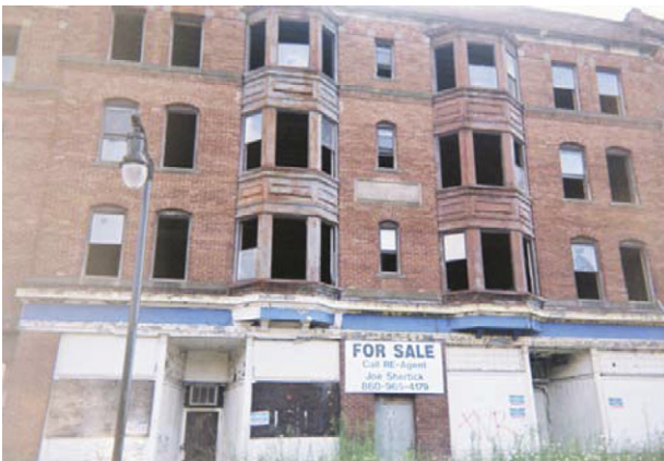
Built environment: vacant buildings (7/2010)

"In our neighborhood, we saw eyesores, such as bad-smelling dumpsters that make us unhappy. These discourage us to exercise in our neighborhood."