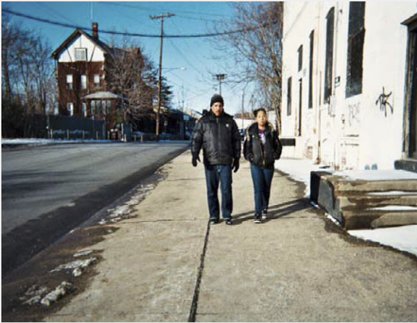
Transportation: unsafe streets (12/2009)

"We walk to exercise our bodies, but we would like it better if there weren't any gangs to mess up our streets." (reflection and photo by Vilma Padilla)