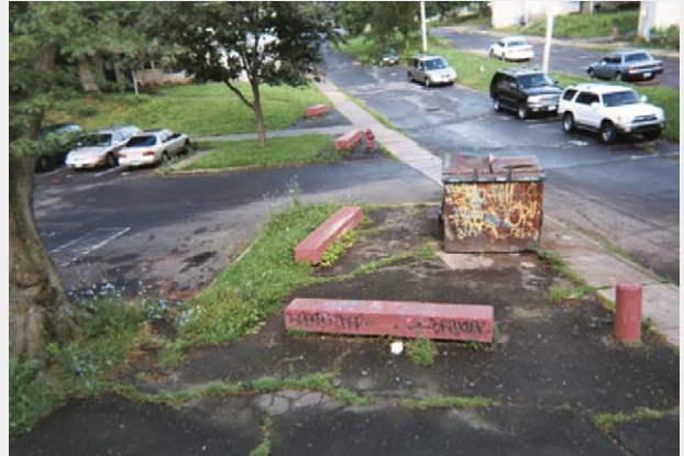
Built environment: neighborhood decay (7/2009)

"We walk to exercise our bodies, but we would like it better if there weren't any gangs to mess up our streets." (reflection and photo by Vilma Padilla)