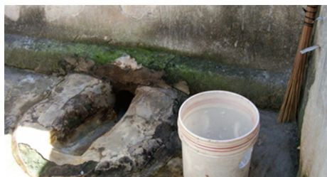
FIGURE 2: Example of a typical toilet. The water is used for cleaning the latrine, rather than for washing hands.

a good toilet. It does not have a covering and the surroundings are not that good, but it is all because I do not have money.”