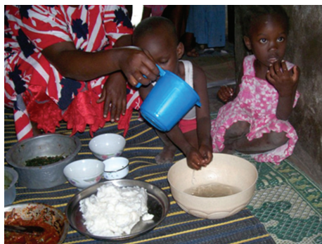
FIGURE 6: Washing hands before mealtimes. Note the absence of soap or soapy water.

references to cooking with water (with 15 photos from 9 households and a total of 151 verbal references from all 13 households); general cleaning (5 pictures from 4 households and 41 verbal references from 12 households); washing dishes (14 pictures from 9 households and 64 verbal references from all 13 households); the task of obtaining water (14 pictures from 8 household with 50 verbal references from 12 households). As household 5 points out, “water is used for all the activities.”