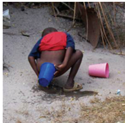
FIGURE 3: Picture of a child defecating outside. This is a common practice due to fears of children falling into the toilet holes.

The last child toileting practice observed was the use of diapers and diaper changes. In at least one household (household 10, see Figure 4), children have their diapers changed on the floor. When questioned about the practice, the mother explains that “I dress the child (change the diaper) on the floor because when you dress on the bed the child tends to jump up and fall down. So, I decided to sit on the floor and dress the child for safety.”