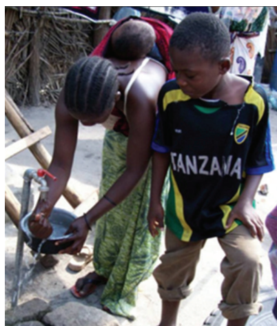
FIGURE 5: Example of handwashing after cooking. “Handwashing” is commonly a practice of having hands placed under running water.