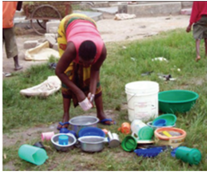
FIGURE 8: The common practice of leaving dishes on the ground to dry.

Drinking water is also generally the only water that is potentially treated. Two of the households (10 and 12) reported filtering their drinking water though the filtration method was not reported. Households 8 and 9 add chemicals or “medicine” to their water but could not name the substance used. Household 7 boils the water used for drinking. Two households use a combination of techniques to keep the water safe (chemicals and boiling in household 9; filtering, chemicals, and boiling children’s water in household 3).