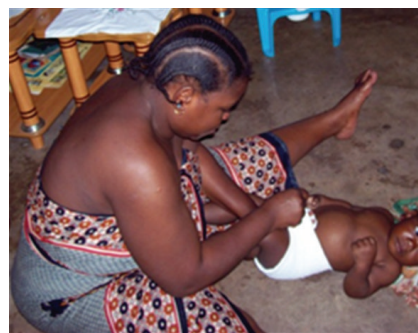
FIGURE 4: Mother changing her child on the floor for safety concerns. However, this same floor can be used for meal preparation and consumption.

3.2. Hand Washing. Four families photographed themselves or family members washing hands. In the interviews, 9 different families made a total of 30 references to hand washing behavior. Households 1 (see Figure 5), 2, and 12 (see Figure 6) documented and photographed hand washing practices, hoping to demonstrate their hygiene practices, with household 12 emphasizing: “Even if they take fruits, tea, in everything I wash their hands. . . I insist for them to wash their hands so that they will not eat while their hands are dirty.”